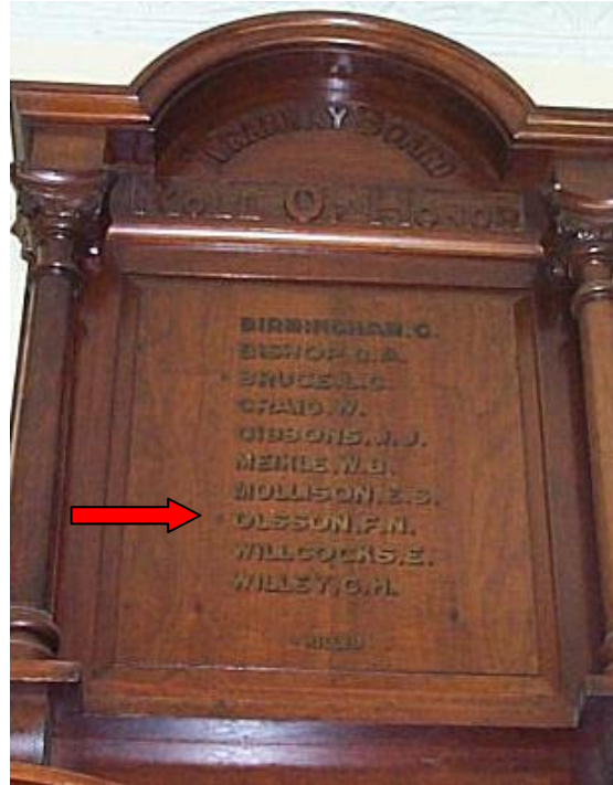
Melbourne and Metropolitan Tramways Board Honour Roll for World War 1

F. N. Olsson is remembered on the Melbourne and Metropolitan Tramways Board Honour Roll for World War 1, which is located at 21 Coldblo Road, Armadale, Victoria.