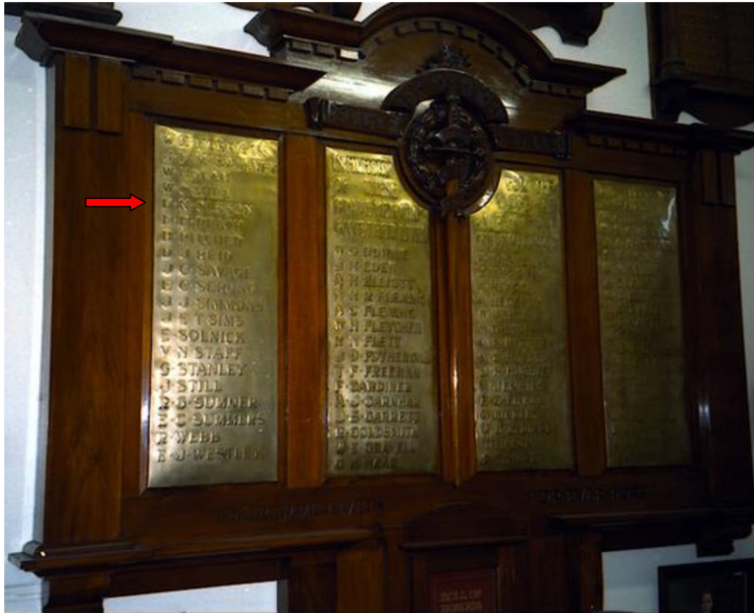
Melbourne and Metropolitan Tramways Board Honour Roll for World War 1

F. N. Olsson is remembered on the Melbourne and Metropolitan Tramways Board Honour Roll for World War 1, which is located at 21 Coldblo Road, Armadale, Victoria.